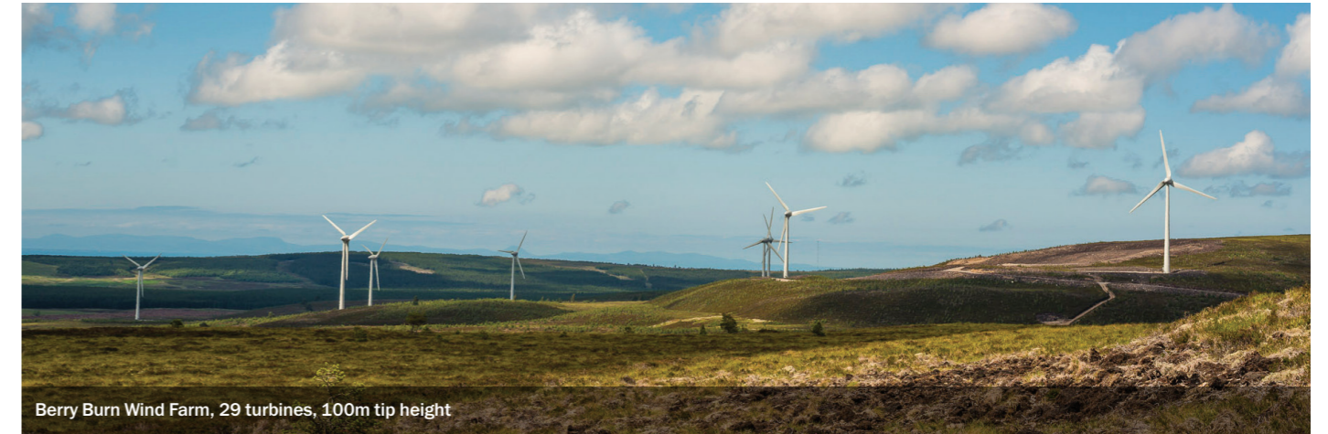
Berry Burn Wind Farm, 29 turbines, 100m tip height