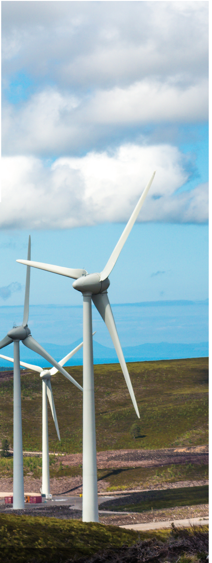
Berry Burn Wind Farm, 29 turbines, 100m tip height

For more information about the existing Berry Burn Wind Farm and operations www.berryburnwindfarm.co.uk