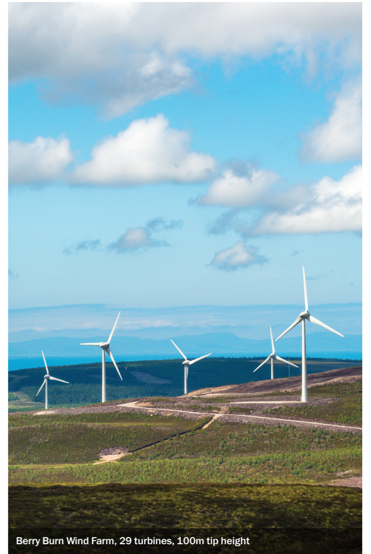
Berry Burn Wind Farm, 29 turbines, 100m tip height

In August 2019 Airvolution Clean Energy was acquired to further our ambitions of delivering more renewable energy projects across the UK.